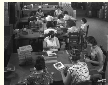
[Women boxing cigars at Cuesta-Rey factory, 1932]