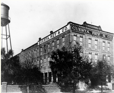
[Cuesta-Rey Factory, 1912]